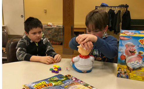
On Saturday evening, families with children gathered for a meal, playing board games, a movie and snacks!

After a successful HBC Got Skillz, our youth look forward to leading Highland in all three worship services on Sunday, March 3. Our youth will breathe life into the Courage to Imagine by the sharing of their own gifts and reflection on Jesus' Transfiguration. As always, there is much going on amidst our youth community—it is a gift any time we can share the joy we have found, together, with all in our congregation.