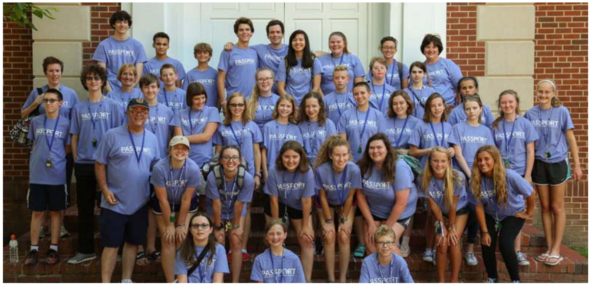
Highland's youth and chaperones at this year's PASSPORT Camp.