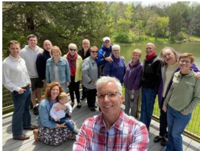
The Messengers Class met this weekend for a picnic gathering!